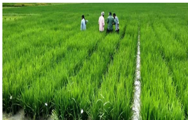
Picture 01: Field view of heat tolerant experiment at Agriculture Research Station, Gangavathi

Yield data were obtained from screening of the rice accessions showed the genotypic difference. The highest yield was